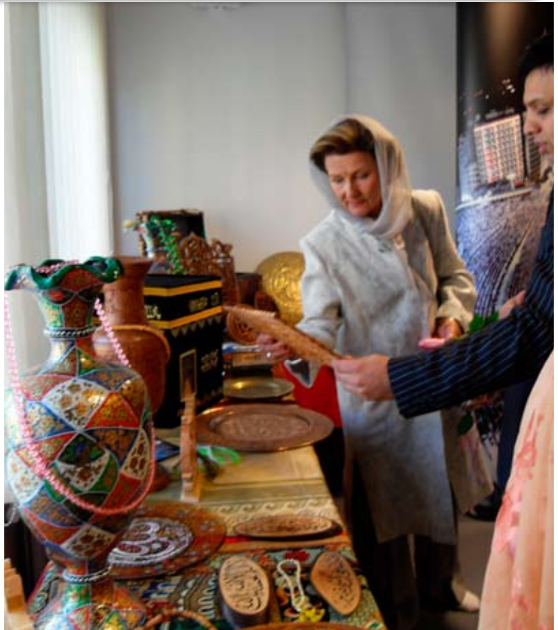
Queen Sonja of Norway visits the 'Islam Exhibition' at the Islamic Cultural Centre Norway, May 2009.