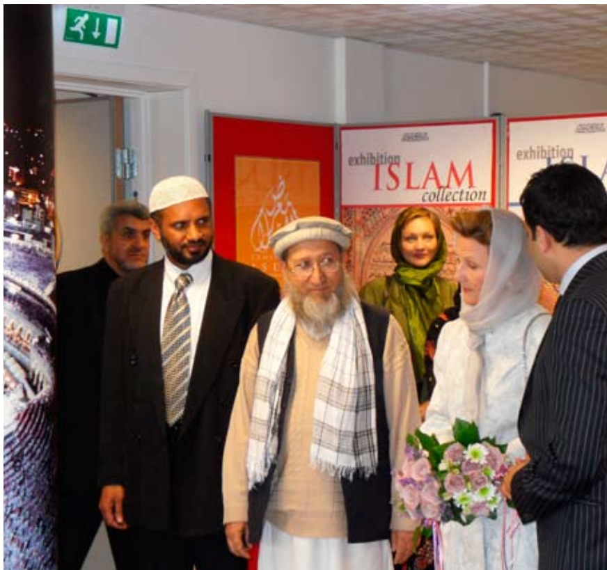
Queen Sonja opens the exhibition in Oslo, Norway.

The 11 day exhibition was attended by over 5,000 visitors, including delegates, civic and religious leaders and members of the general public.