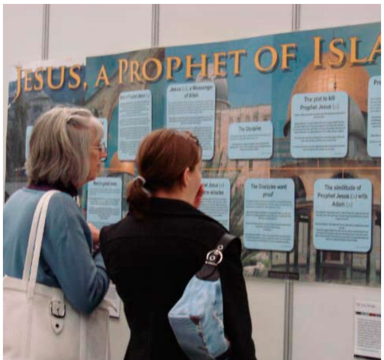
Visitors take a tour of the exhibition at the ICC Cape Town in July 2009.