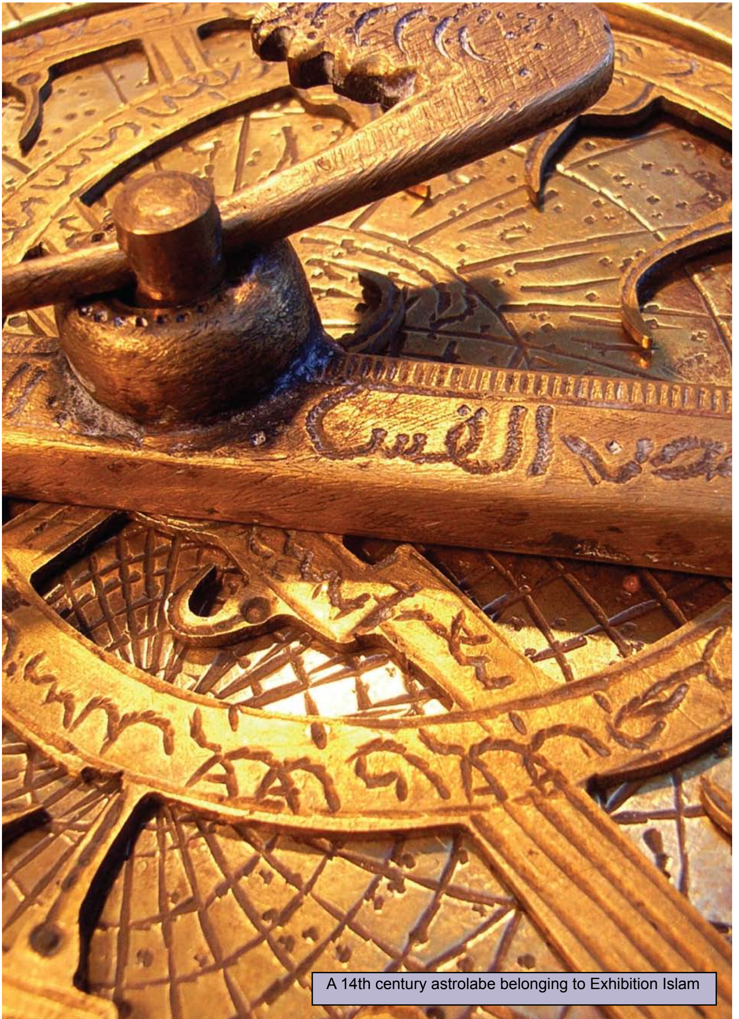
A 14th century astrolabe belonging to Exhibition Islam