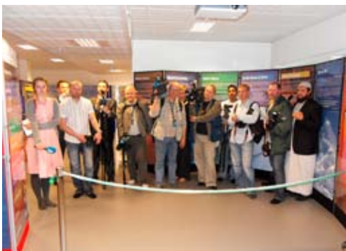
Norwegian Press wait for the Queen to make an appearance.

Exhibition staff conduct a guided tour with visitors from America. As a sign of respect for the Islamic faith, female visitors usually drape head-scarves when visiting the exhibition, especially if hosted in a mosque.